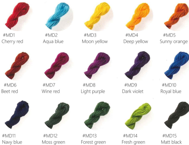
The color sample is dyed at a concentration of Dye liquid:Water/ 50:50. The thread is MT2 (20/6).

*15 colors, *50ml/pouch *Things to dye : Cotton thread