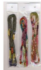
(7mm x 32"/piece)

[*] Other sizes 5mm & #3mm are also available. Please contact us in detail.