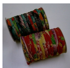
(7mm x 11 yards/reel)